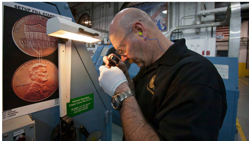
A worker inspects finished 1¢ coins at the Mint in Denver, Colorado.

The cost to produce a Lincoln cent is approximately 3.7¢, and, last February, President Trump ordered the Secretary of the Treasury to end this waste.