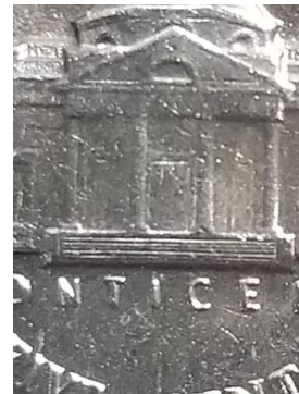
1946 d ANACS 5.5 Steps