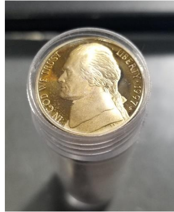
Roll of Modern Proof Nickels

Such coins typically have good eye appeal and lower cost aspects. Because I collect the way I do, I can have some difficulty putting together a collection of Jefferson nickels I’m proud of. To resolve this issue I have come up with the idea to assemble a “One-A-Year” Nickel Collection – the one that goes from 1913 to date. This way, buffalo nickels are incorporated into the collection to help make the Jefferson nickels portion of the collection more appealing- to me anyway. That’s my plan.