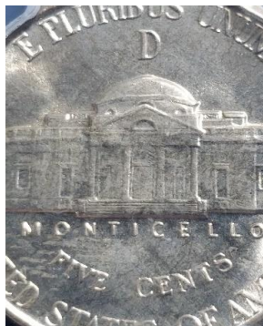
1943d PCGS Full Steps