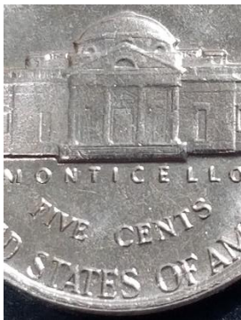
1958 Choice BU

What defines a “Full Step” nickel? From what I can gather, the nickel must be a business strike uncirculated piece and have 5 to 6 complete (uninterrupted) steps leading up to the Jefferson Memorial. While PCGS designates such nickels as “Full Step”, ANACS designates them as having 5 step, 5.5 step, or 6 steps.