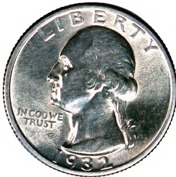
This 1932 Washington quarter has been subjected to abrasive cleaning, which left scratches on the president's bust and in the field.

Abrasive cleaning is a process that physically scrapes metal off a coin's surface, leaving behind hairline scratches. This is the most common form of cleaning and is often done unintentionally. Many coins are rubbed with cloths, tissues, paper towels, etc., with the beholder having the mistaken belief that these "soft" materials are harmless and can remove some unwanted substance from a coin's surface. In reality, this wiping or rubbing risks damaging the coin and leaving behind fine hairline scratches. These hairlines can reach across the field into device areas, instead of conforming to natural wear patterns. Hairlines can be present on isolated patches of a coin rather than the entire surface when a spot or stained area is targeted. Uncirculated coins are especially harmed by this process, as the flow lines that make up a coin's natural mint luster are delicate and easily disrupted. Hairlines also show up more prominently on uncirculated examples when tilted in the light. It is important to note that abrasive hairlines should not be confused with die-polish lines. The most notable differentiator is that die-polish lines are raised, while abraded hairlines are recessed. It's also rare for die polish to occur on device areas of coins.