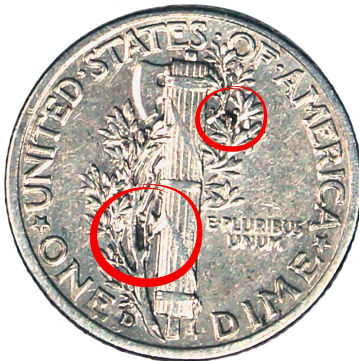
This 1943-D dime has been dipped. Note the residual grime trapped in recessed areas missed by the dipping.

Dipping involves applying a chemical solution to a coin's surface and removing a thin layer of metal. This method is most commonly used on older silver coins to remove toning, oxidation, or tarnish. This attempt to erase the passage of time gives the coin an unnatural brightness unbefitting of its age. A dipped uncirculated Morgan dollar can appear as if it were minted yesterday, ignoring over a century of environmental exposure. Dipped circulated examples display oddly bright surfaces; where there should be dirt and grime, there's bare metal instead. Many times, coins are dipped more than once or for extended periods. Overdipping coins creates flat, lifeless luster and a washed-out or chalky appearance, as the more a coin is exposed to the chemical mixture, the more surface metal is removed and the more damage occurs. Although dipped coins, done gently, can still be accepted and straight graded by grading companies, it more often than not decreases a coin's numerical grade as it sacrifices originality, and the dipping can reveal scratches and abrasions hidden by natural processes like toning.