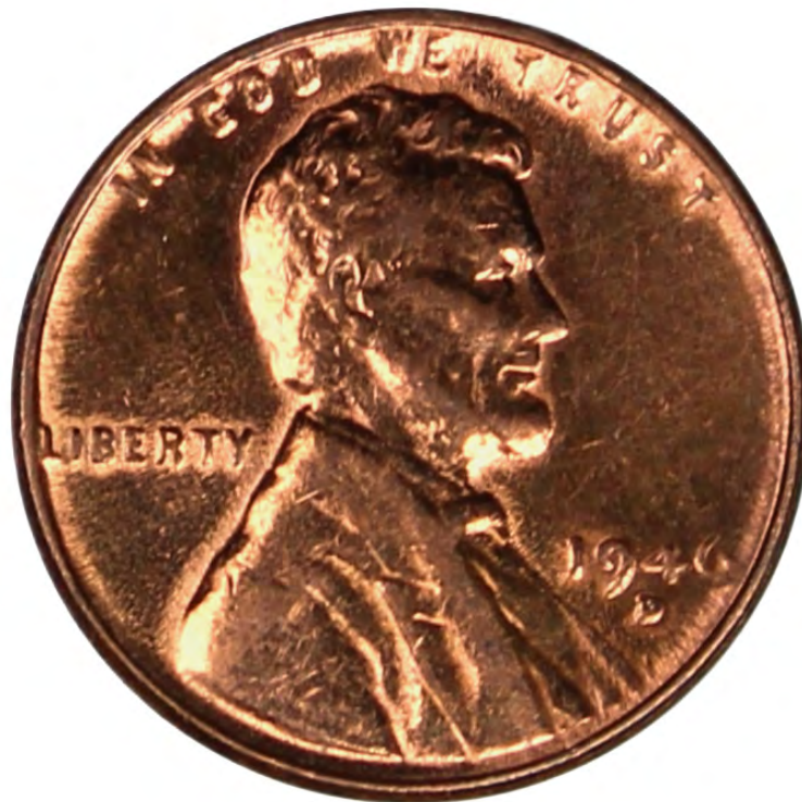
Polishing often results in rounded lettering and a prooflike appearance, as evidenced by this 1946-D Lincoln cent.

becomes abnormally shiny and reflective, even when compared to proof coins. While polishing is an acceptable practice in the jeweler's toolkit, this does not carry over to coins, where greater emphasis is placed on originality.